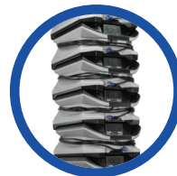
Nesting design for vertical and bookshelf style stacking