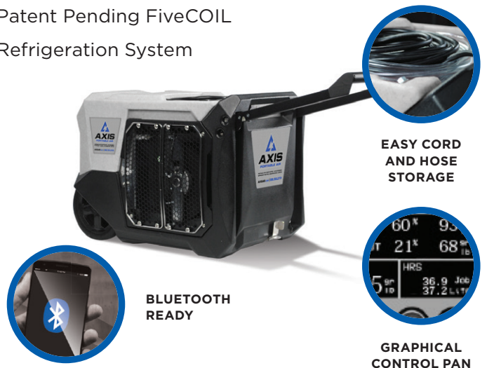
EASY CORD AND HOSE STORAGE

Bluetooth Connected Phoenix DryLINK APP Graphical Control Panel Patent Pending FiveCOIL Refrigeration System