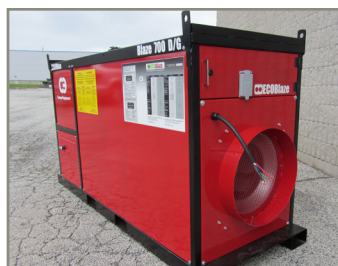
Skid Mounted LPNG or Diesel Heaters EB700D/G, EB1000D/G, EB2000D/G

Campo Equipment 6 Carson Ct – Brampton, Ontario Canada – L6T 4P8