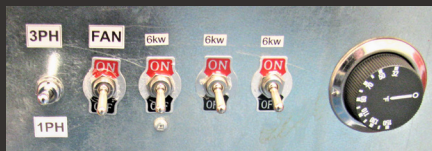
EBB6/9E Control Panel 30 or 50amp