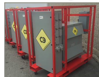
Temporary Portable Power Distribution and Breaker Panels