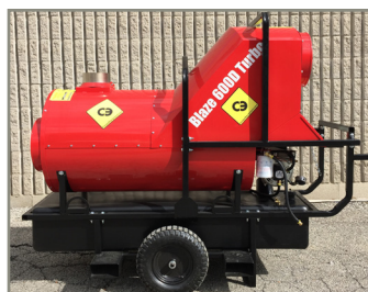
Cart-mount Indirect Fired Heaters Available in Oil/Diesel Fired or LPNG From 200K to 600K BTU